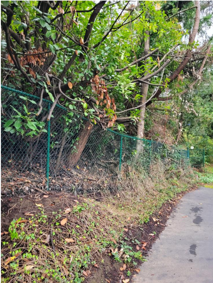
Photo 6: Westerly property line from private road access to neighbors below