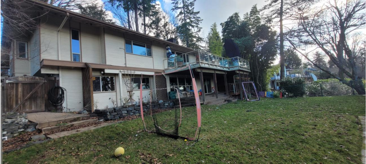
Photo 5: West (rear) yard south. Deck repaired/replaced like for like in situ.