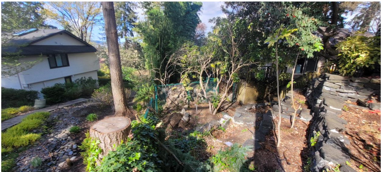
Photo 4: Watercourse on neighboring property (left rock bed), green chain-link fence demarks more or less property line, example of dry stone laid retaining walls throughout the site partially cleared by Owner.