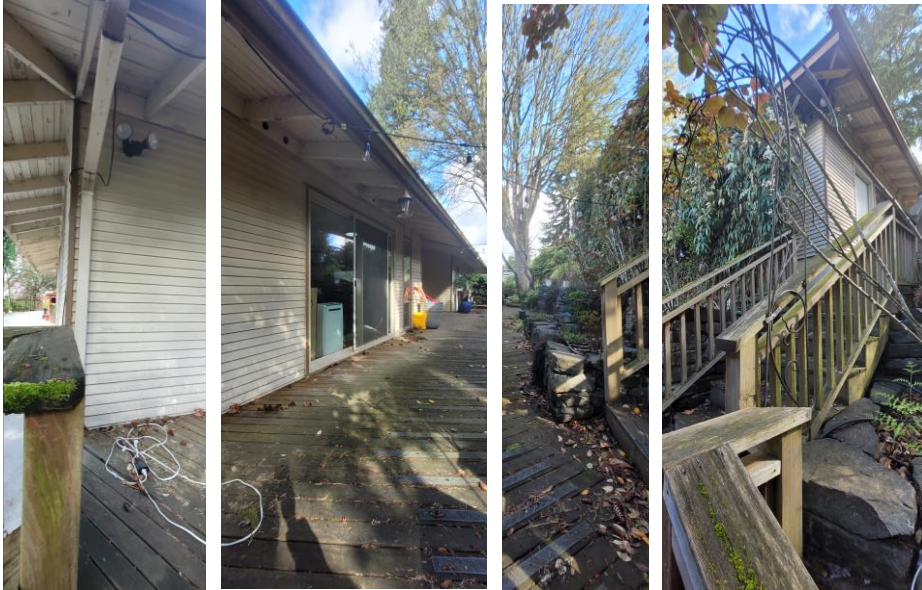
Photo collage 3: East wall of existing house and concrete slab/wood deck rockery/planters/retaining walls between main house level and garage level south stairs up to garage level. Rebuild deck/stairs like for like. Replace planters/retaining walls with concrete system between addition and existing/new stair.